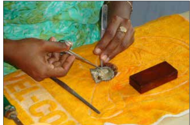
Fig. 2. Spherical Nucleation by trainees at Sippikulam, Thoothukudi

Trial implantations and Technical evaluation of team: On gaining confidence, a test of their skill was conducted by allowing the beneficiaries to do the entire practice