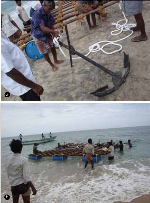
Fig. 1. a-b. Farm erection by fisher folks at Sippikulam, Thoothukudi

were taught. Fishermen were assembled at the shore and demonstration was carried out, technical features involved in fabrication of the raft were taught. Fishers were involved in fabrication of rafts and the entire activities were supervised. The fabricated raft was towed into the sea with the help of a fishing vessel. Mooring sites were selected by diving and observing the underwater conditions. Floating rafts were moored by installing anchors (Fig. 1a-b).