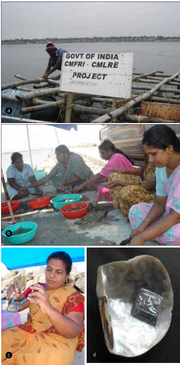
Fig. 3. a-d. 'Mabe' implantation and farming at Kollam centre Kalpeni (Lakshadweep Islands)

implantation. The skill was evaluated by the project personnel. The fisherwomen showed tremendous interest and developed the skill to independently handle the 'mabe' implantation work (Fig. 3 a-d).