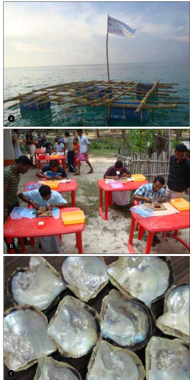
Fig. 4. a-c. 'Mabe' implantation and farming at Kalpeni Is, Lakshadweep.

Stock building and suitability studies: Since, there was no sizeable population available at Kalpeni Island, various sizes of pearl oysters were transplanted from mainland to Islands. Spats (900 nos. with an average of 6.6 mm DVM) were also transported in oxygen filled plastic bags for studying the survival and growth in farm.