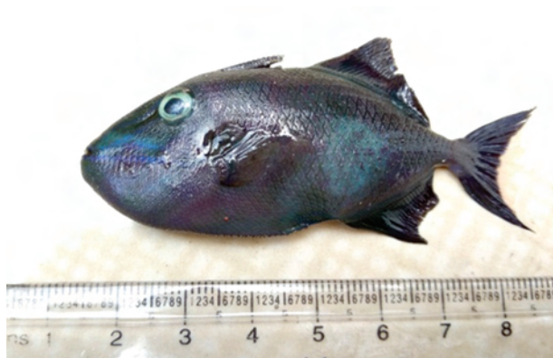
Fig. 1. Red toothed triggerfish

However, species and size of bait for pole and hand-line fisheries of yellowfin tunas differ from those for skipjack tuna. Relatively larger fishes belonging to the family of damsels and fusiliers are the common baits for the yellowfin tunas.