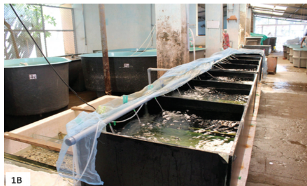
Fig. 2. Indigenous RAS in operation

Circulated water leave the tanks through outlets fitted on the top corner of the tanks and will be collected in the common outlet pipe which leads to the first compartment of the filter assembly, which gets filtered through different compartments and subsequently gets collected in the fifth compartment (Figs. 1 & 2). Water circulation can be maintained round the clock at a flow-rate of 5 \text{ L min}^{-1} in each tank. The first compartment of the filter filled with sponge bags and sponge mat were routinely (weekly) taken out, cleaned, dried and replaced with cleaned sponge bags. The components of rest of the compartments were cleaned and replaced on a monthly basis. It is also advisable to siphon the tanks if uneaten feed remains in the tank even after the stipulated time for normal feed consumption, which may reduce the overall load to the filtration assembly. At the time of feeding, water circulation should be stopped for effective feeding, to reduce feed leaching and also for better observation of fishes and feeding activity.