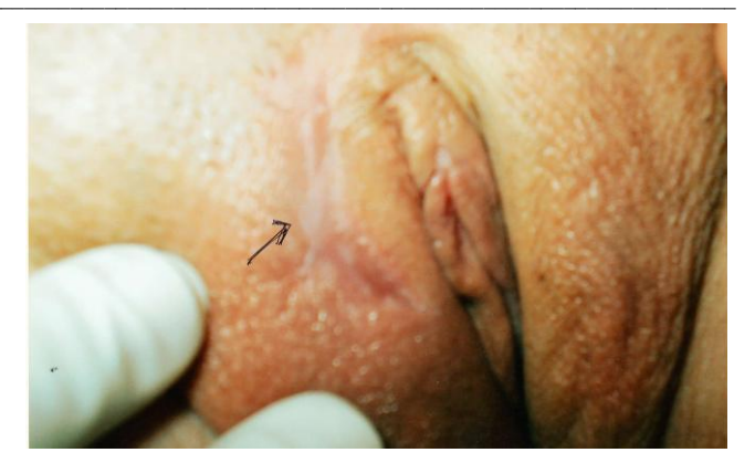
Figure 3: Cicatrix post ulcus vulvae

Urine: Turbid, yellow, sour, sediment; enormous amorphous urate salts, 8-10 leukocytes, frequent bacteria, 10-15 epithelial cells.