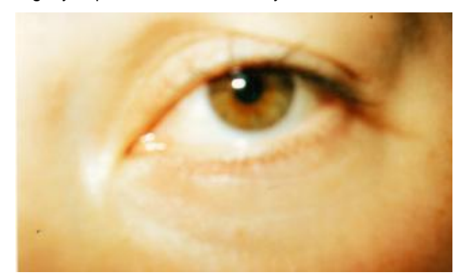
Figure 1: Conjunctivitis chronic recidivans

In the lower lip of the mucous membrane on the left side, there is erosion limited by a healthy mucous membrane, as large as a medium plaque. In the genital mucosa at the side of the left side there is a perforation with a diameter of 1 \times 1 cm in round shape, and in the mucous membrane at the entrance of the vagina on the left side shows an erosion with a clear limit of irregular shape, diameter 1.5 \times 0.5 cm with white suture on the yellow. On the right side of the large lips, a catheter is visible after the ulceration (Figure 2, 3).