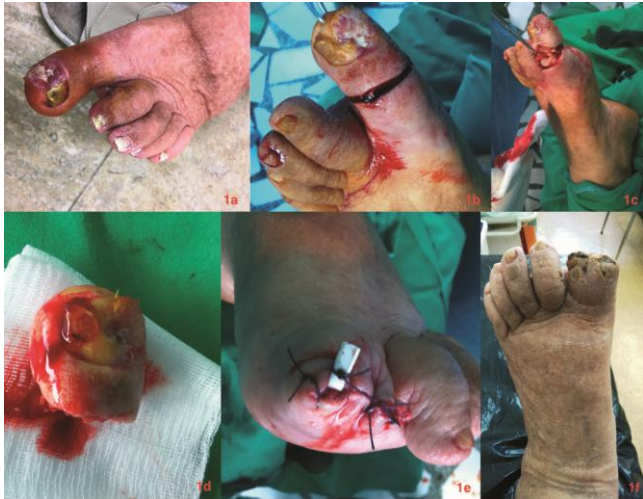
Figure 1: Clinical presentation: 1a - Chronic persistent ulceration in the left toe; 1b - Intraoperative findings. Skin incision; 1c - Disarticulation of the interphalangeal joint; 1d - The resected distal phalanx; 1e - Disarticulation completed - single layer suture and drainage; 1f - Clinical findings on the 16 th postoperative day

microscopy with KOH. No trauma was remembered by the patient, nor was there a history of viral warts. Arterial hypertension and arrhythmia were reported as comorbidities, well controlled with medications (Enalapril 10 mg 1-0-0, metoprolol 12.5 mg 1-0-0, and torasemid 20 mg 0-1-1). The initial symptoms were treated as an ordinary fungal infection with systemic administration of itraconazole and topical application of 40% urea cream, without significant effectiveness during the following year. Because of the lack of improvement, the nail bed was biopsied, and the diagnosis of SSCC was confirmed by histological examination (Figures 2a to d).