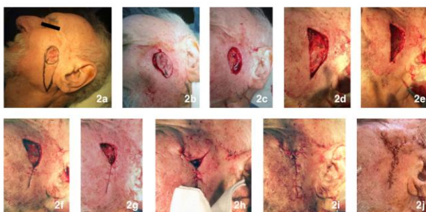
Figure 2: 2a) Patient with basal cell carcinoma of the cheek, preoperative clinical finding. Marking of the resection fields; 2b) Oval excision of the primary tumour with island flap plastic planning. Step by step dissection; 2c) VY flap. Oval excision of the primary tumour and island flap plastic planning. Clinical status immediately after the excision; 2d) Gradual extension of the defect in the shape of a triangle at both of the ends and changing of the primary idea for island flap performance. Medical Institute of the Ministry of Interior, Clinic of Dermatology, Venereology and Dermatological Surgery, 2017, Sofia, Bulgaria; 2e) Gradual extension of the defect in the form of a triangle. Electrocoagulation; 2f) Defect closing from distal to proximal direction. Gradual adaptation of the wound edges by single skin stitches; 2g) Intraoperative finding with minimising the size of the defect by gradually adapting of the wound edges; 2h) Expansion of the defect forward the pre-auricular area, leading to better adaptation of the wound edges; 2i) Post-operative findings; 2j) Post-operative findings. VY flap

Losing this thread, in practice, it turns out that we are losing the patients themselves or, looking laconically, we are working with reduced efficiency and effectiveness.