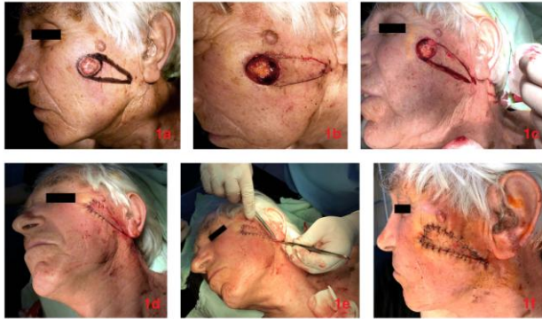
Figure 1: 1a) Island flap. Patient with keratoacanthoma (histopathologically verified after the surgical excision), located in the area of the left cheek, Medical Institute of the Ministry of Interior, Department of Dermatology, Venereology and Dermatological Surgery, 2017, Sofia, Bulgaria; 1b) Oval excision of the primary tumor; 1c) Extension of the wound edges in the shape of triangle peripherally. Preparation of the distal and proximal part of the created skin island; 1d) Transposition of the skin island in the proximal direction followed by careful adaptation of the wound edges; 1e) Adaptation of the distal part of the island; 1f) Post operative clinical finding

surgical and medical oncologist, etc. The advantages of these specialities are mainly based on good medical practice and good surgical techniques that are applied. In contrast, their disadvantages are based on the lack of good awareness of the initial surgical approach as well as the need for time-adjusted and accurately performed additional surgical interventions which should be furthermore carefully scheduled with the relevant oncology units.