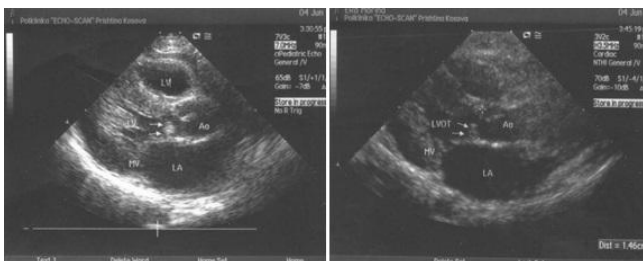
Figure 2: Transthoracic view of eight years old boy, previously operated from perimembranous VSD, showed subaortic membrane few millimeters under aortic valve, closing left ventricular outflow tract

In all patients pre-operative trans thoracic echocardiography demonstrated increasing velocity in left outflow tract with e mean peak of 3.9 m/s plus or minus 1.1 m/s with a mean peak left outflow tract gradient of 60.8 plus or minus 19.3 millimeters of mercury. Trivial aortic insufficiency was noted in 8 patients (44 %), mild in 6 patients (33%) and absent was in 4 patients (22%).