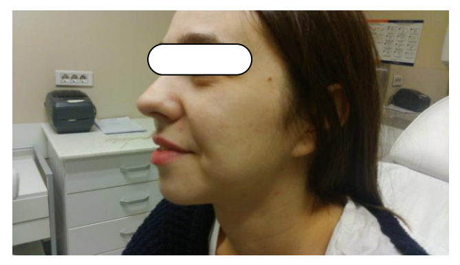
Figure 2: After 3 treatments with fractional carbon dioxide laser