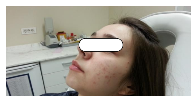
Figure 1: Before laser treatment

The success of treatment is objectively seen in photographs taken before and after the treatment.