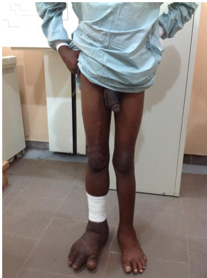
Figure 2: Shows bilateral elongation of both lower limbs worse distally, and on the right with prominent superficial veins taking the course of the long saphenous vein with varicosities. Note also hypertrophied peni- scrotal organ.

a port wine stain while atypical type does not include a port wine stain [4]. The latter is quite rare. The index patient had port wine stains on both palms and soles of both feet, seen as a pink discolouration of one half of the palm/foot.