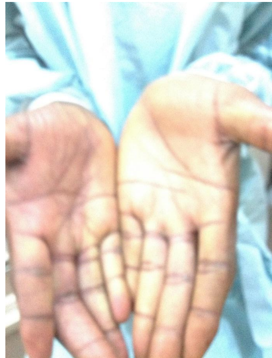
Figure 1: Port wine stain noted on the right palm.

Firm bandaging of the affected limb was applied in order to reduce lymphatic flow and prevention of infection. Antibiotics and pain relief were also prescribed. Patient is still being awaited as the managing team have decided to bear the cost of the rest of his investigations and treatment. Surgical debulking of the right foot is being envisaged at the moment.