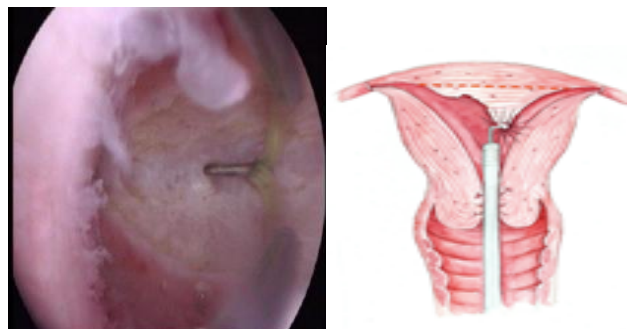
Figure 2: Hysteroscopic metroplasty in uterus septus.

probably involved in the uterine function. The theory which is nowadays widely accepted, states that septum is consisted of fibroelastic tissue with inadequate vascularization and changed ratio between blood vessels of the endometrium and myometrium, presenting negative effects on decidualisation and placentation [14].