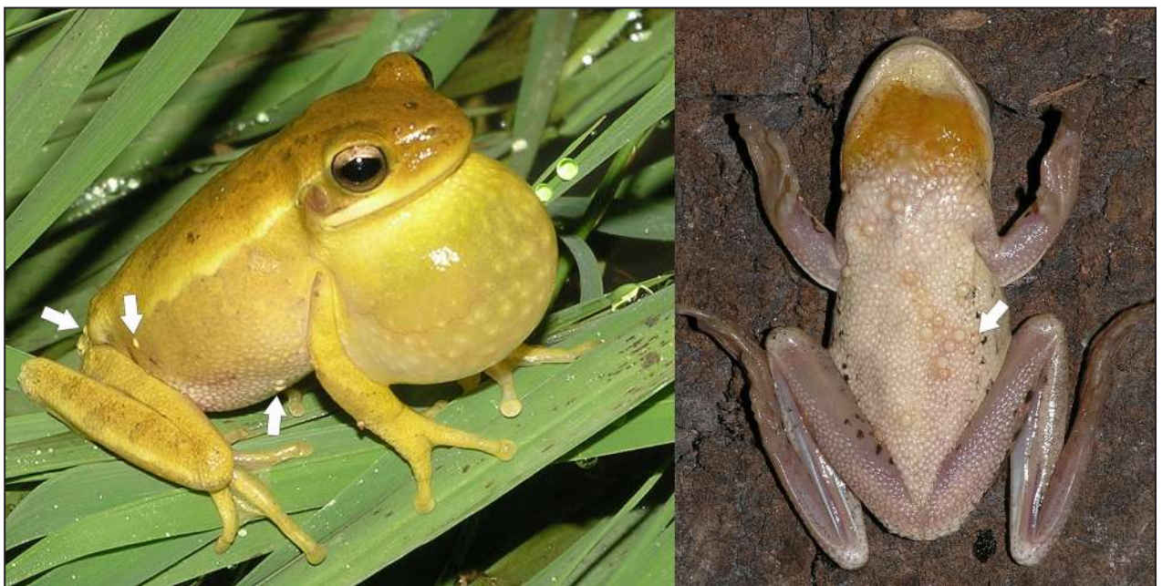
Figure 1. Frogs of the species Boana pulchella (Hylidae) at Laguna de Rocha, Uruguay, infected by Valentines rwandae (Dermocystida). Left: male calling at a breeding site. Right: ventral view of another male in life. Notice the skin nodules that bear dermocystid sporangia (arrows).

In addition, we explored the data with a generalized linear model of binomial distribution (infected/non-infected) in which the presence of each pathogen was considered as the dependent variable. Season and year of sampling were considered as independent variables, as also the presence of the other pathogen. Variable contributions to the models were compared by means of analysis of variance, ANOVA-LRT (Zuur, 2009), and removed when not statistically significant ( \alpha \geq 0.05 ). Summer