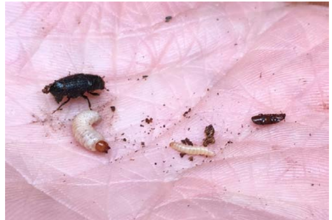
Photo 2: Pest Dendroctonus micans adult and larvae (left) and predator Rhizophagus grandis adult and larvae (right).

population of the pest and therefore the damage that it causes.