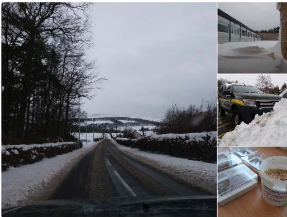
5:45 AM - 2 Mar 2018

Braved the #BeastFromTheEast and #SNOWMAGGEDON today to feed the #hungry #beetles @Forest_Research! Thanks to Colin and the FR truck! ❄️🌨️🐞