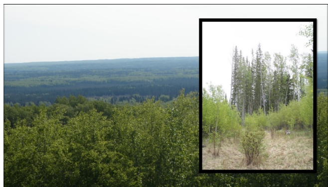
Fig.1 Boreal mixedwood forests: heterogeneity across the landscape and at small scales

Boreal mixedwoods comprise landscape mosaics of deciduous, mixed and coniferous stands at various stages of succession. As such they are heterogenous across a variety of spatial scales. Clear-cutting is the dominant harvest technique across the boreal zone and fundamentally alters natural ecosystem processes and biodiversity by reducing landscape heterogeneity. Despite this, understanding of how environmental heterogeneity and beta diversity are structured in forest ecosystems and post-clear cut is lacking, with most research focusing on alpha diversity measures.