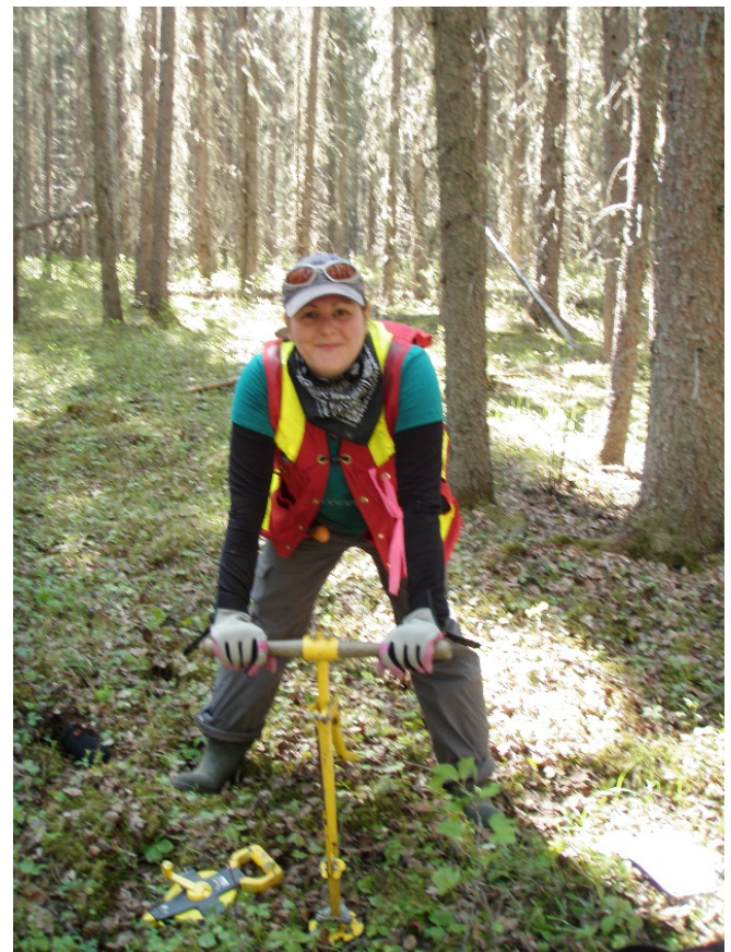
Fig 2. Setting pitfall traps at the EMEND site in 2010.

However, at smaller scales, spider beta diversity reflected the lower environmental heterogeneity in regenerating stands, whereas staphylinid and carabid assemblages were not homogenised 12 years post-harvest. Differences between forest types were also important at small scales.