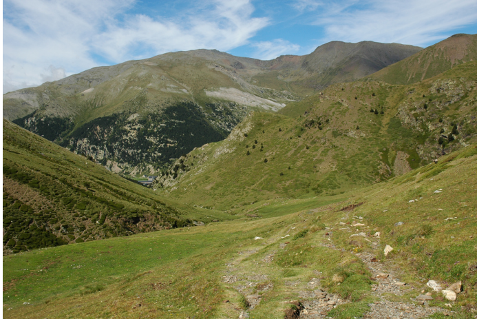
Fig. 2 | High altitude pastures in Puigmal massif (2910m) (Nuria valley, Eastern Pyrenees).

The Roman landscape occupation probably involved a complementary exploitation of natural resources in north-eastern Catalonia. A certain specialization of resources by geographic areas is attested, focused on agriculture and livestock in the littoral plain and mining in high mountain areas. Later, during Late Antiquity (6th–7th AD), mountain and littoral resource exploitation diversified in the context of a more self-sufficient economy. In this sense, the development of metallurgical activities is now documented in the littoral plain, while livestock expanded in the high mountain Pyrenees.