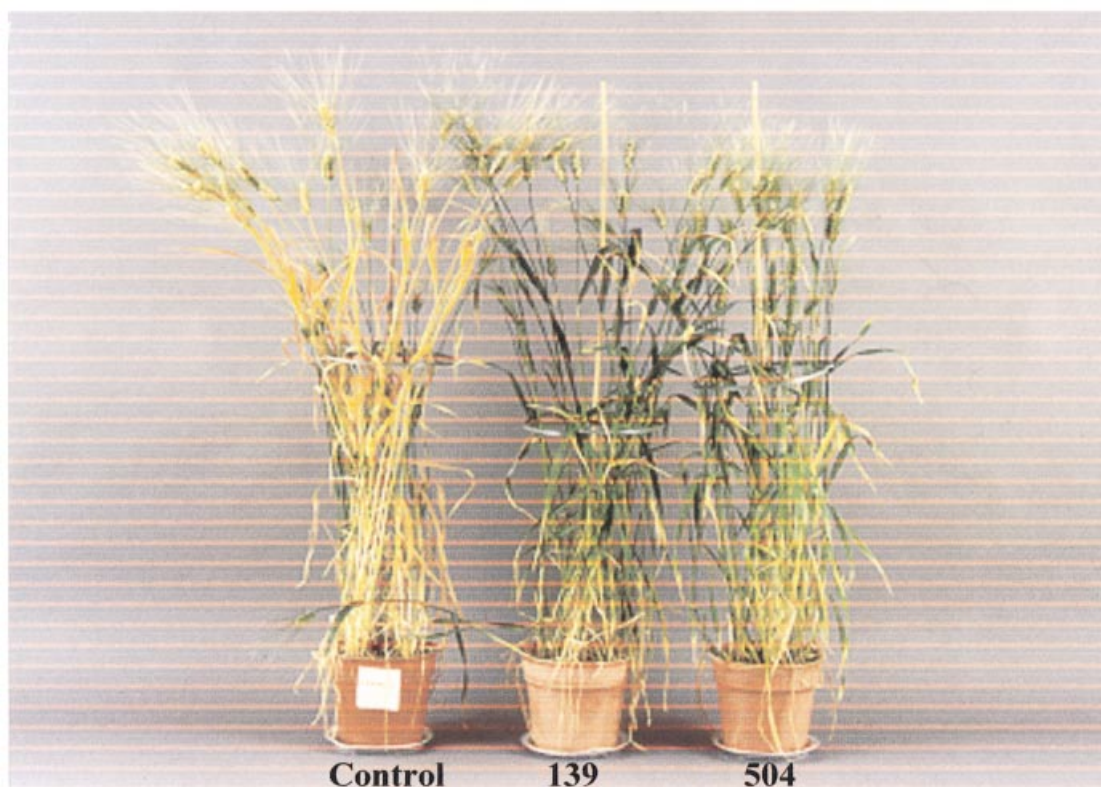
Fig. 1. The 'stay green' phenotype in durum wheat. Control plant, cv. Trinakria; 139, mutant 139; 504, mutant 504.

variable fluorescence ( F_v = F_m - F_o ) to maximum fluorescence ( F_m ) (Genty et al. , 1989).