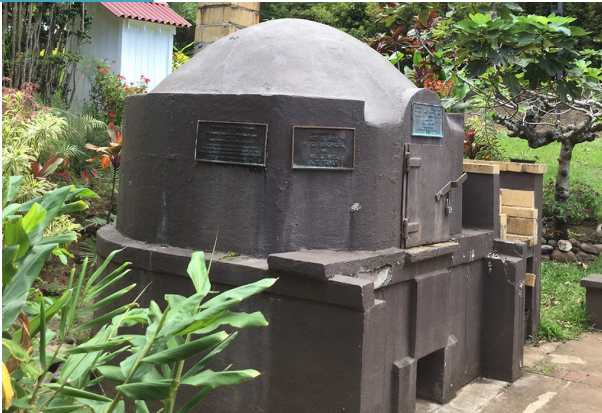
Figure 3.5 Traces of Portuguese societies in O'ahu