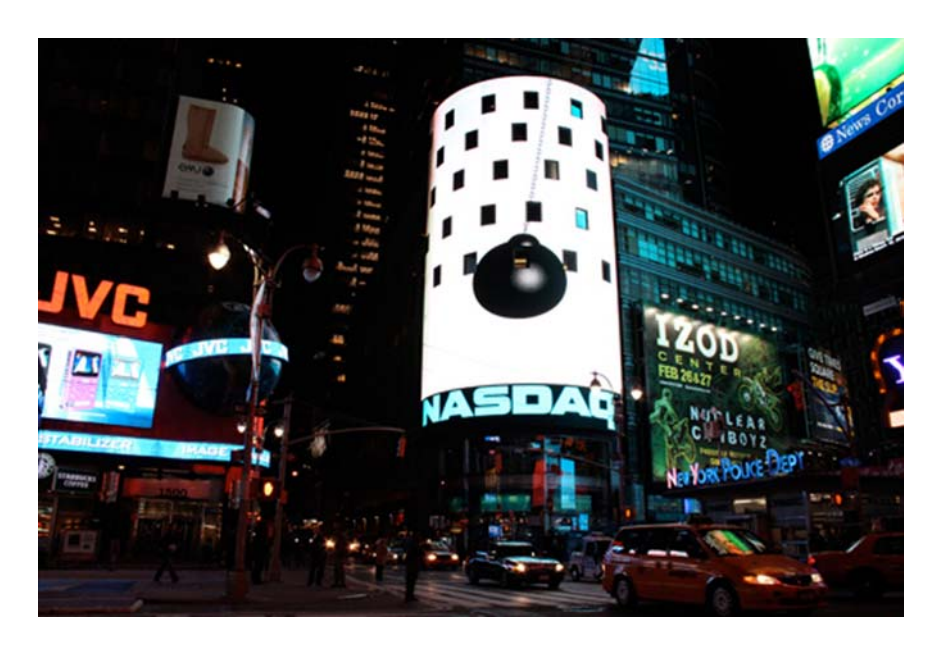
FIGURE 3 Alexandre Arrechea. Black Sun.

position occupied by the work of art in the subsequent decade; the expansion of Cuban culture to other settings like Madrid and New York; the conditions in which Caribbean art has been internationalised by means of large-scale exhibitions and events organised by institutions inside and outside the region; and finally the current state of artistic activity in the Caribbean, at a new moment of expansion whose particular characteristics require a more detailed examination.