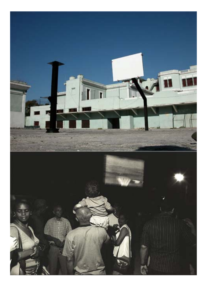
FIGURE 2 Alexandre Arrechea, Sweat.

direction that art in the country had adopted. Educated at the Instituto Superior del Arte (ISA), an institution that played the main role in the successive artistic reforms that have happened since the eighties, the members of the group have played a leading role during a decisive moment in the unfolding of Caribbean creativity now in a process of unprecedented expansion.