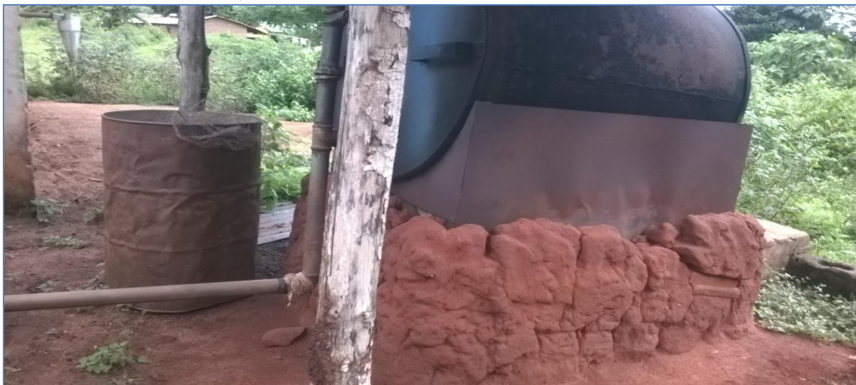
Figure A2: Modern Rice Shelling Machine