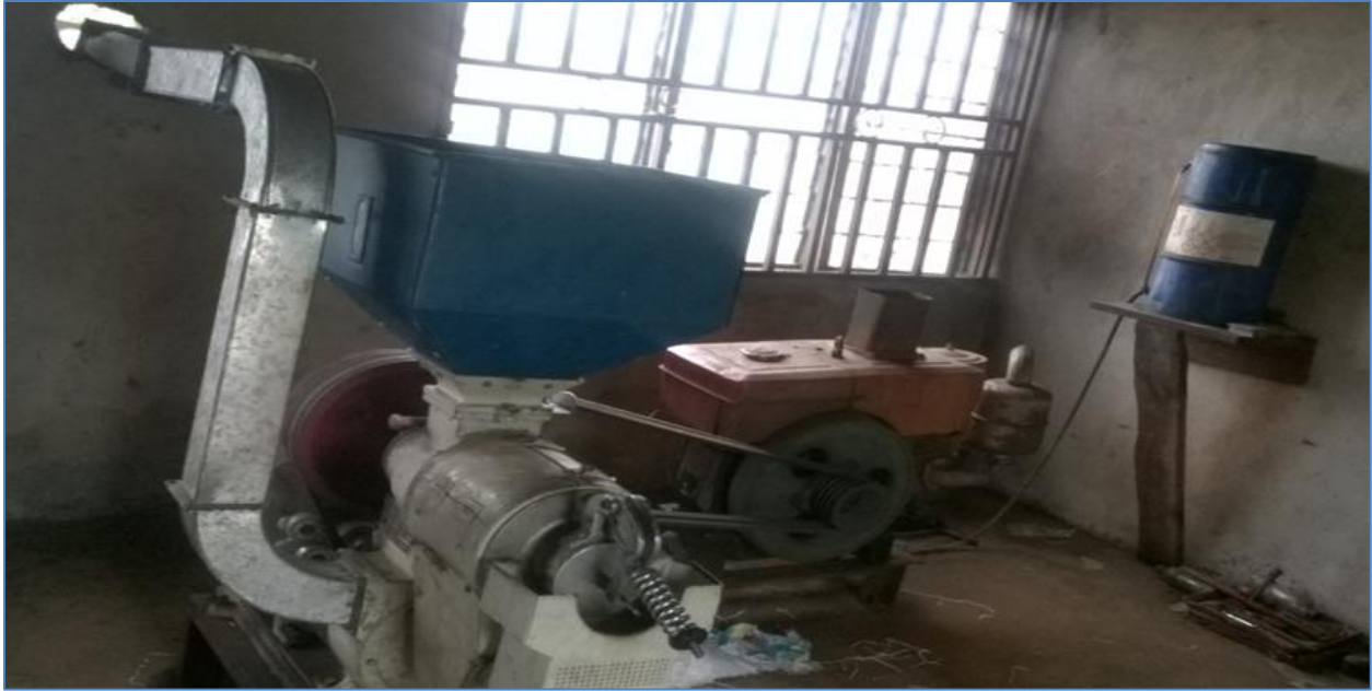
Figure A3: Stone Removal Machine ( Destoner )