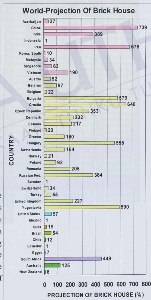
Diagram 2.2: Projection of buildable brick house (%) for each country

For further investigation, we streamlined the data from 62 countries (as in Table 2.1) to only 43 countries (as in Table 2.2) that possessed both data on Brick Production and Housing Constructed per indicated year. These both data are further used to form the basis of World Wide Map projection of Building Brick Production.