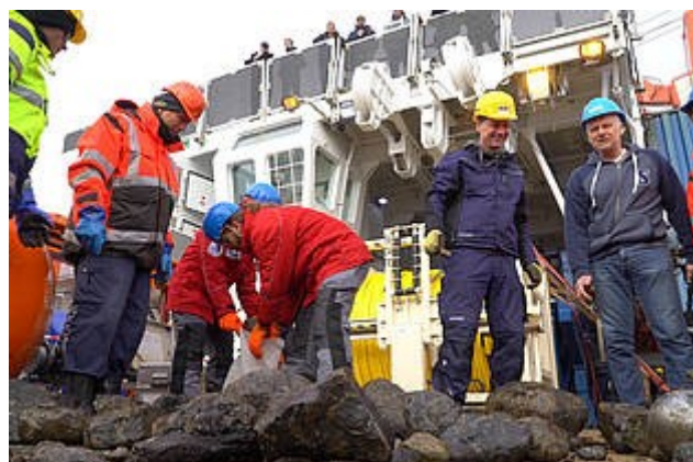
Outcome of a successful sampling with the dredge

Models explaining the sedimentary basin evolution of the Arctic ocean not only hold information for science but also help establishing a verifiable rating of the resource potential of this so far poorly evaluated area. There are incomplete data bases concerning risk assessment in the possible future usage of those resources. The BGR Hannover's aim of the GREEMATE project which is conducted in cooperation with AWI Bremerhaven, UFZ Leipzig and the University of Bremen is to contribute to both topics. Furthermore scientists from GEOMAR Kiel, further AWI work groups and scientists of the Laboratory of Polar Ecology Bruxelles are on board to work on additional projects.