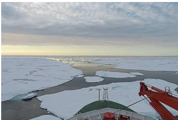
Fig. 1: Sea ice patches off Cape Morris Jesup make it difficult to continue surveying with the geophysical equipment towed behind the vessel.

Seeing this as a spectacular opportunity to survey unmeasured areas up to more than 84°N in the Lincoln Sea, we restarted seismic profiling with the 3 kilometer streamer after leaving the mentioned ice field behind at 83°N on Sunday morning.