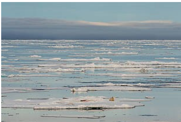
Fig. 1: Fields of sea ice in front of Kronprins Christian land- a polar bear eating his prey.

Additional helicopter flights were planned to proceed with on land sampling in the permitted area around 120 km away, unfortunately these plans had to be aborted because of heavy fog that only cleared for a brief period of time. Said time window was too short to cover the distance of 120 km in a helicopter and a Narwhale protection area made it impossible to shorten the necessary flight distance by moving the ship closer to the shore. For that reason geological sampling was postponed to the next good weather window and we switched over to reflections seismic measurements.