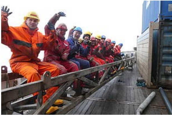
Fig. 3: Geological sampling ended successfully.

a danger for it. The mission to retrieve a GPS-Station from the TU Dresden and Collection of more Samples on land was given up, due to the absence of suitable weather for flying.