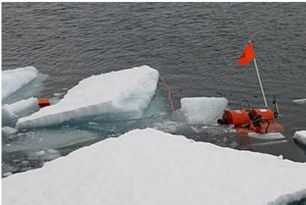
Fig. 3: An ocean bottom seismometer surfaced close to a sheet of ice.

In addition to the reflection seismic data, that depicts the shallower crust, a refraction seismic profile was collected, consisting of 9 equally spaced (10 km) ocean bottom seismometers (OBS) for further insight to deeper crustal structures such as the boundary of Greenland and the Morris Jessup Rise.