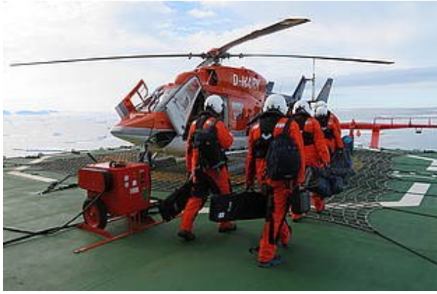
Fig. 3: Teams of geologists are preparing to be flown to the near coastal outcrops.

Thanks to the good weather and ice condition forecast, as well as the predictive and safe ship navigation any collision of our dragged 3 km streamer and drifting ice flows or smaller ice bergs (growler) could be avoided. Besides seismics, other geophysical methods like gravimetry and magnetics could be deployed, giving us further insight to the sub-seafloor structures of the only 150 - 300 meters deep shelf