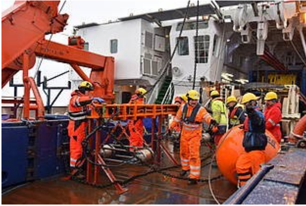
Fig. 2: The airgun array is prepared for deployment to subsequently generate signals for the refraction seismic survey.

At 84°18.73'N we reached the end of the BGR's most northerly reflection seismic profile so far. Thickening ice made us shift our work westwards to the eastern Lincoln Sea, where helicopter borne ice reconnaissance promised better working conditions.