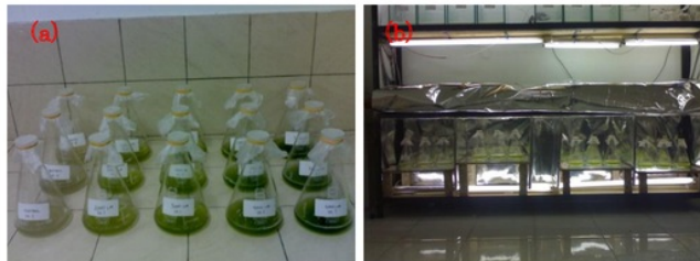
Figure 1. (a). Growth profile of Scenedesmus sp. in different concentration of tapioca wastewater (b). Different concentration of Scenedesmus sp. culture in growth chamber