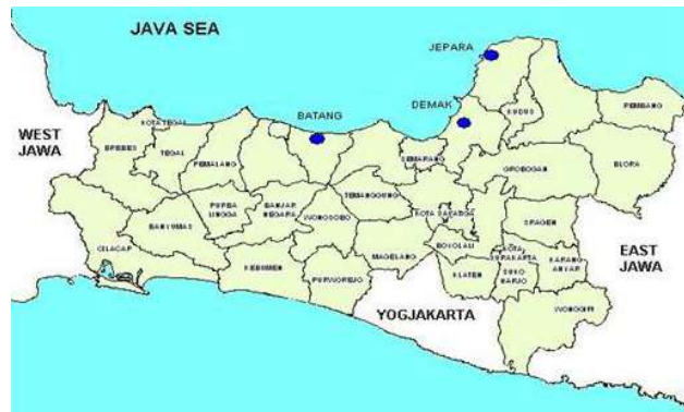
Figure 1. Map of Terasi sampling regions (●)

Sampling of terasi was done randomly from terasi production area i.e Northern Coast of Central Java i.e Jepara, Demak and Batang from traditional producer (blue dots on the map below).