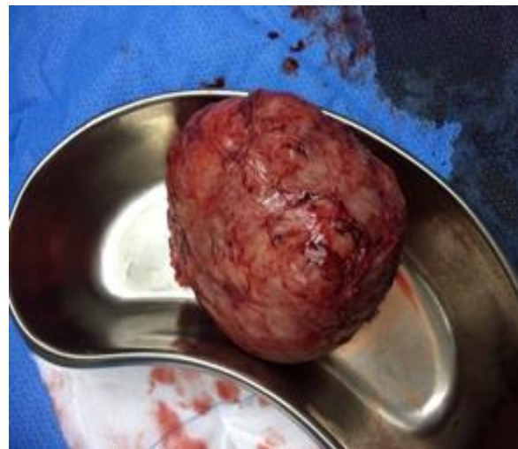
Figure 2: Specimen of broad ligament myoma