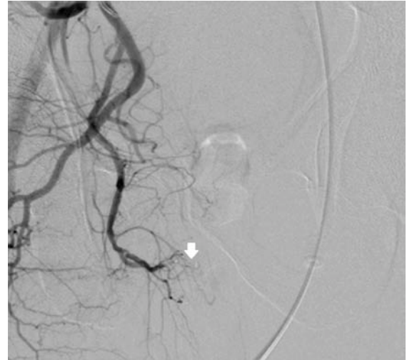
Figure 2: Complete occlusion of the arteriovenous fistula post embolisation with histoacryl glue 30% over the distal branches of right internal pudendal artery.

Principally, the aim of the management of hemospermia was to exclude malignancy and treat any other underlying cause. Most patients would seek