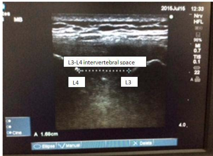
Figure 1: The ultrasound estimation of the intervertebral distance using Sonosite™ (M Turbo 2008-01, USA) showing the vertebral spines at L3-L4 vertebrae

by two horizontal lines using an invisible ultraviolet marker, and the L3-L4 IVS was defined as the distance between the marks. The midpoint of the two lines was taken as the reference point (“Point M”) from which the point identified by the palpation method was measured and compared.