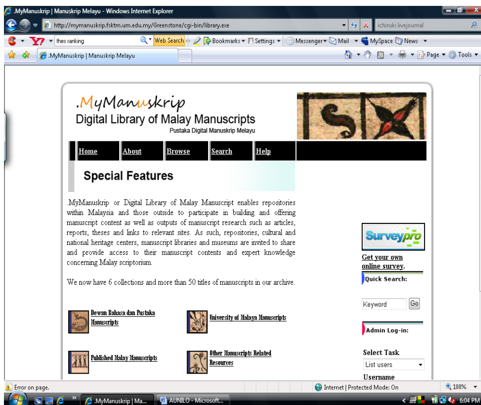
Fig. 1: MyManuskrip

MyManuskrip or the Digital Library of Malay Manuscripts (Fig. 1) has 6 collections with more than 50 manuscripts, The collections are the Dewan Bahasa dan Pustaka Manuscripts, University of Malaya Manuscripts, Universiti Kebangsaan Malaysia Library, National Library of Malaysia, Published Malay Manuscripts and Other Manuscripts Related Resources. The manuscripts are scanned and uploaded to the DL and are placed in one of these categories – customs, language, folk prose, traditional medicine, historiography, folk poetry, religion, history