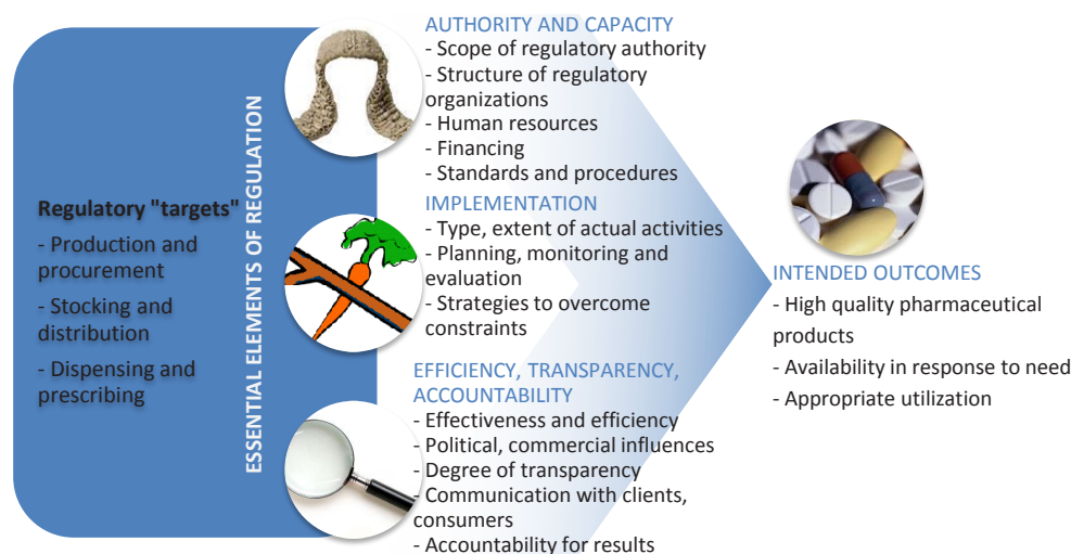
Figure 1. Framework for Regulation of Quality and Availability of Tuberculosis (TB) Medicines (Adapted From Ratanawijitrasin and Wondemagegnehu 1 ).

We drew on data from case studies on the regulation of TB medicines in India, Tanzania, and Zambia commissioned by the WHO, and conducted by a team of researchers led by the lead author in the period from 2009-2011. 12,13 These