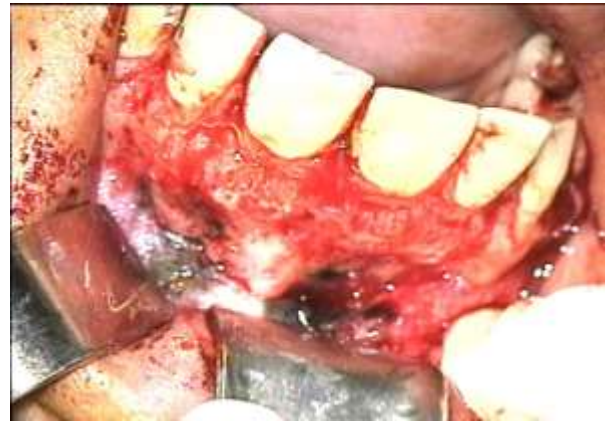
Figure 2. Destruction of buccal plate

patient was told to return for the first follow-up visit after 6 months, but she did not, because of distance from the medical center.