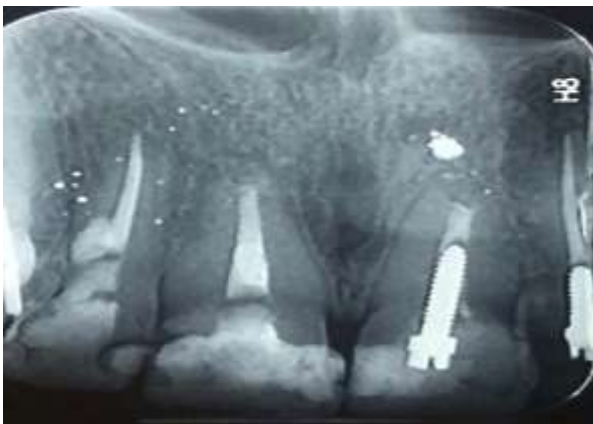
Figure 6. Periapical radiograph 75 months after treatment

After 75 months from the surgery, the patient returned to Endodontic Department of Kerman Dental School for the treatment of another tooth. A clinical examination of central incisors (including percussion and palpation) showed no pain, no periodontal defect, and no gingival discoloration. The restoration was intact with no signs of compromise in integrity or marginal adaptation. Radiographic examination