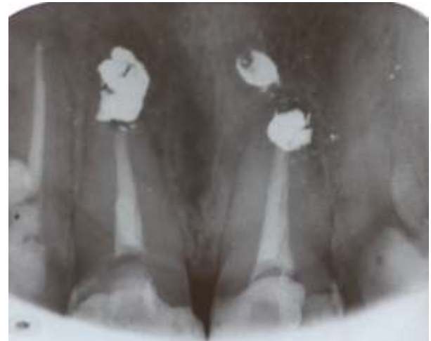
Figure 1. Periapical view before re-surgery

years later, a sinus tract appeared on the buccal mucosa and apical surgery was performed by a general dental practitioner. After 13 years, strong pain and tenderness were associated with these teeth.