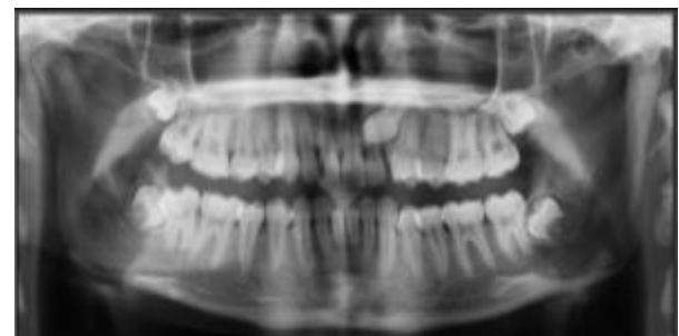
Figure 3. Impaction of left maxillary canine

was the most frequent missing teeth, followed by maxillary permanent lateral incisor. Maxillary canines and mandibular second premolars were the most incident impacted teeth. Supernumerary tooth was the next common anomaly with the incidence rate of 6.6%. Out of the 22 supernumerary teeth, mesiodens was the most common supernumerary tooth detected among 8 men and 3 women with the ratio of 2:1.