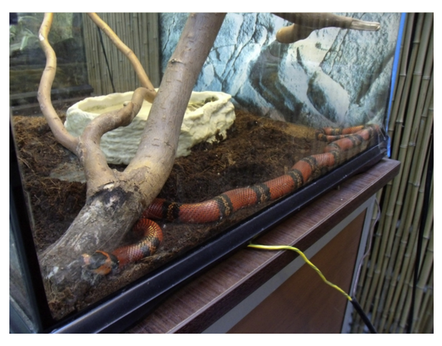
Figure 2. Terrestrial near rectilinear motion: milk snake (Lampropeltis sp.) in hobbyist/private conditions.

Claims regarding sedentarism and spatial insecurity are poorly considered by many keepers. For example, in highly exposed areas, many species will naturally utilize local cover during locomotion or seclude themselves in small or tight refuges at rest, but such behavior constitutes only part of overall activity budgets (Gillinghan, 1995; Mendyk, 2018). Agoraphobia is a human anxiety condition and not recognized in snakes (Warwick, et al., 2013). Extensive natural home ranges, as outlined previously, dismiss notions that snakes do not use space. Indeed, were snakes truly both sedentary and agoraphobic then keepers would require no vivaria frontage or lids and could open all enclosures confident that snakes would not leave the proposed security of their cages. However, snakes