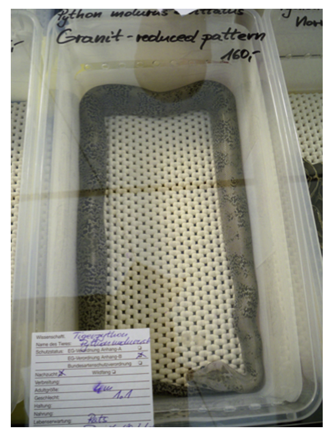
Figure 4. Attempted rectilinear motion: python ( Python sp.) in pet 'fair', 'expo' 'market' conditions.

reproductive exhaustion or obesity, and thus these factors are not reliable indicators of good welfare.