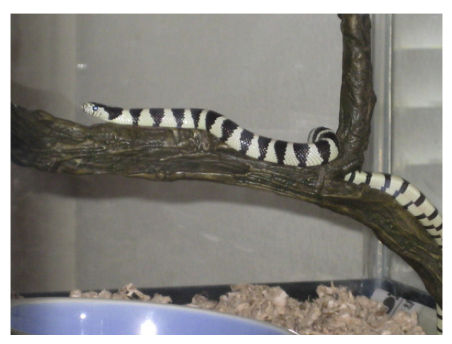
Figure 3. Concertina motion: kingsnake (Lampropeltis sp.) in hobbyist/private conditions.

Regular feeding and breeding is frequently also reported in association with captivity-stress where energy may be redirected toward basic biological functions (Warwick, 1990a,b, 1995; Broom & Johnson, 1993; Moore & Jessop, 2003), which may result in