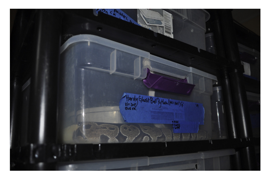
Figure 6. Close view of a racking system enclosure showing a Royal ('ball') python (Python regius) under minimalistic spatial and other provisions..

attract legal consequences (Warwick et al., 2017). Therefore, between possible misinterpretation of numerous behavioral and physical signs and particular transparency concerns, it may be appropriate to regard overly positive anecdotal reports relating to snake welfare in diminutive enclosures and racking systems with a degree of circumspection. Accordingly, the lack of reliable information from the commercial and private sectors may represent serious under-reporting of minor and major problematic issues associated with truth telling surrounding sensitive topics (Moorhouse et al., 2017; Warwick et al., 2017). Figures 5–7 provide examples of a racking system.