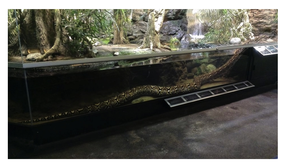
Figure 1. Aquatic rectilinear motion: python (Python sp.) in zoological conditions.

Common justifications for spatially minimalistic enclosures and husbandry practices involving snakes in general are based on a number of beliefs, including that snakes are sedentary, insecure in large environments, do not use space, suffer from agoraphobia (anxiety related to open spaces) and anorexia, and further that snakes thrive in small spaces, and feed, grow, and reproduce well (for example, Bartlett & Bartlett, 1999; Engler, 2010; Iherp, 2011; McCurley, 2005; Pets4Homes, 2018; Reddit, 2015; TBC, 2018). However, these views are not universal among herpetologists, herpetoculturalists, and other snake keepers (for example, Mendyk, 2018; Rose et al., 2014; Silvestre, 2014).