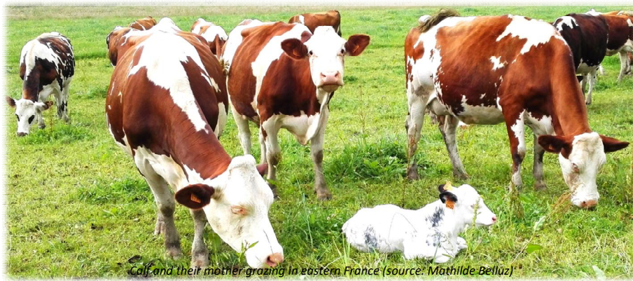
Calf and their mother grazing in eastern France

Improving animal welfare on farms is currently a major issue, in response to expectations of citizens and consumers. In organic farming, reflections are continuing on how to change livestock production practices to allow animals to express their natural behaviour most fully. Calf rearing in dairy systems is a focus of attention. At the moment, separating calves from their mothers remains the most common practice, but new techniques that favour the maternal bond are appearing. Understanding these practices better to identify conditions under which they can be adopted by more farmers was the goal of a survey conducted in spring 2018 of organic dairy farmers who rear calves with adult cows. This work has been made under the GrazyDaiSy project, funded by the European Union program Core organic.