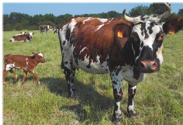
Group of cows and their calves in western France

Among interviewed farmers, 4 leave calves with their biological mother for a short period (15-45 days) before switching them to artificial feeding (no nurse cows). They follow this practice to ensure the health and welfare of the animals or decrease work demands. To avoid decreasing milk production, the calf is separated from its mother before weaning. It may then refuse to feed for at most one day before accepting another feeding system. These farmers consider the use of nurse cows too constraining and think that they do not have the area, buildings, or animals necessary to set up this practice.