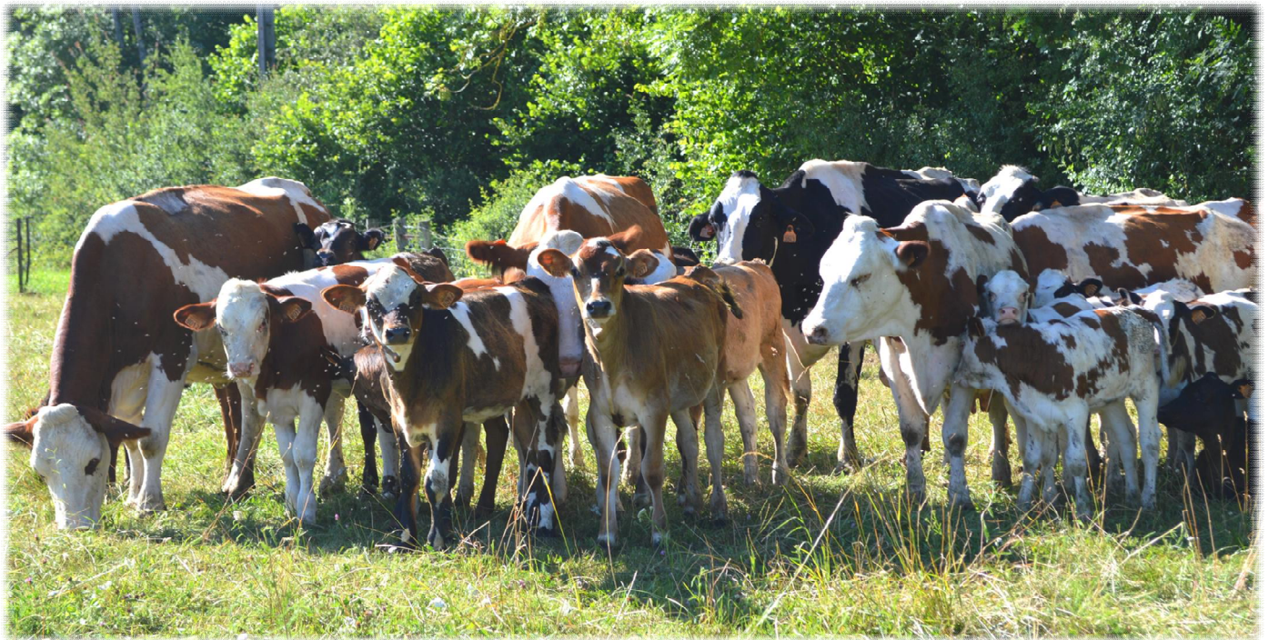
Group of nurse cows and their calves grazing in the experimental farm of INRA-Mirecourt, eastern France

External factors that favour infectious diseases and digestive problems (nipple, milk temperature and milk amount) are better controlled. Early grazing of calves with the cows increases calf immunity, which is why the farmers state that their calves are generally in good health. No treatment is given to prevent cases of diarrhoea or the development of parasites. There are thus fewer sick calves and thus lower veterinary bills.