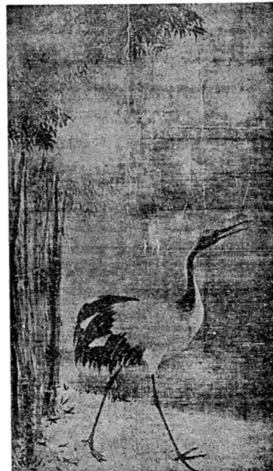
Crane by Mu Ch'i

The same may be said regarding calligraphy. Just because a piece of calligraphy was written by a Zen monk, or just because it consists of Zen words or phrases, does not mean that it can ipso facto be said to be Zen calligraphy. On the other hand there are instances of calligraphy which can be said to be Zen calligraphy even though they are not the work of Zen monks and even though they do not contain Zen phrases. For example, although Isshi was a Zen monk, his calligraphy is not as Zen-like as the calligraphy of Jiun, who was a monk of the Shingon sect.