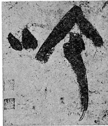
'Gin' (Singing) by Jiun