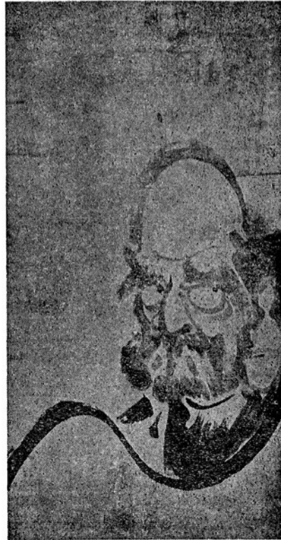
Bodhidharma by Hakuin

In the Bodhidharma painted by Hakuin 白隱, however, the characteristics of Bodhidharma as a Zen master are really well expressed. Since Hakuin was not, however, a professional painter, from the point of view of technique we may feel that there are some things that he could have done a little better. Nevertheless, the Bodhidharms painted by Hakuin are far more Bodhidharma-like than those of Sesshū, Jasoku 蛇足, or Keishoki 啓書記, among others. This is because Hakuin first grasped thoroughly the characteristics of Bodhidharma and, in painting these characteristics, even though technically imperfect, created a suitable style for that expression.