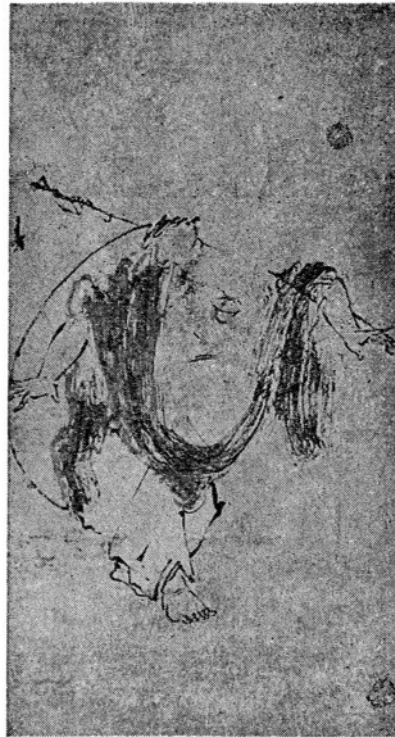
Pu-tai by Liang K'ai

For example, the reason given to explain the appearance of such people as Kaō, Mokuan and Sōami during the period from the end of the Kamakura era to the Higashiyama era, is that Japanese Zen monks of that period went to the China of the Sòng, and brought back Zen paintings of Yīntúolúo, Mùxī, and others. In this explanation, however, the questions as to why the Zen monks who went to Sòng China brought back the works of Yīntúolúo and Mùxī, and why Japan during that period took in these works and was so receptive to their influence, are not dealt with very satisfactorily. If these questions are not asked and are not answered, even the historical explanation cannot be said to have been thoroughly presented. But unless these problems are dealt with by one who has himself genuinely grasped the Zen-Mind, they cannot be answered. This being so, in order to understand Zen aesthetics thoroughly, first the Zen-Mind must be vividly actualized and the question of why the Zen-Mind has to be aesthetically expressed necessarily through such and such a form must be determined. Following this, it must be clearly understood just why the several forms mentioned above as examples of Zen aesthetics—the paintings of Shíkè or Hakuin, the calligraphy of Sū Dōngpō or Jiun, the tea-ceremony, the gardens of Zen temples, etc.—constitute, each in its own way, necessary aesthetic forms for Zen.