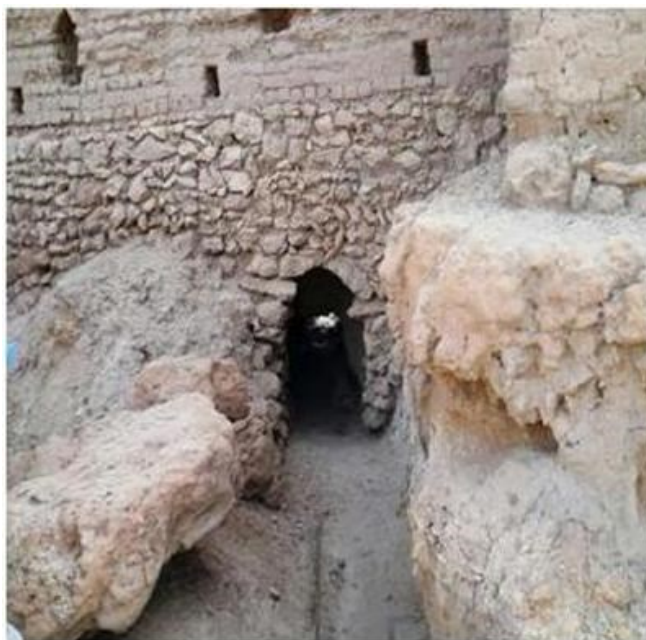
Fig. 2 Output of a foggara below the „ksar“of Ouakda