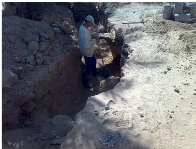
Fig. 5 Rehabilitation of „seguias“in the oasis of Beni Ounif