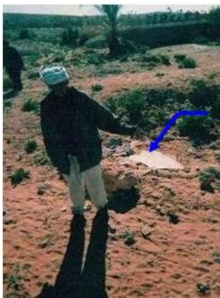
Fig. 6 A well of a foggara in the oasis of Lahmar

The vocation agro pastoral oasis Lahmar is located 30 km from the town of Bechar. The existence of permanent water points allows the oasis to have self-sufficiency in agriculture. The sources of water are drained by 4 foggaras which are located in the northern part of „ksar“. These are Aine Djemal, Omran, Tawrirt and Lahmar. The Tawrirt foggara, the largest of them, includes 18 wells to a maximum depth of 25 metres. The smallest one, Omran, includes 4 wells, 6 metres in depth (Fig. 6). At the end of foggaras, the water is stored in the collective “madjens” (Fig. 7). At the end of “madjens”, each owner receives its share of water through „seguias“. The irrigation of gardens goes in turn. In the oasis of Lahmar, there are 24 families and their descendants who are affected by these water rights. The unit of measurement used in the oasis of Lahmar is “tanast” which corresponds to 45 minutes. Because of the contribution of modern techniques and inheritance issues, the foggaras have been abandoned.