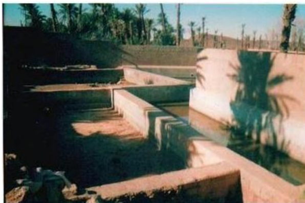
Fig.7 A “madjen” in the oasis of Lahmar