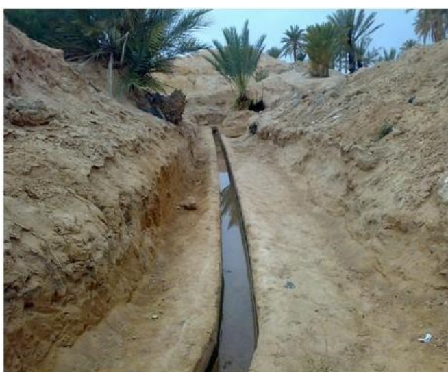
Fig. 4 Seguia in the oasis of Beni Ounif