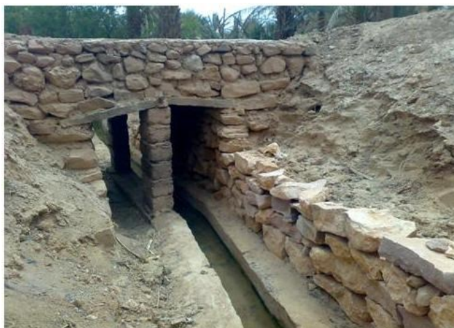
Fig. 3 Output of a foggara of the oasis of Beni Ounif