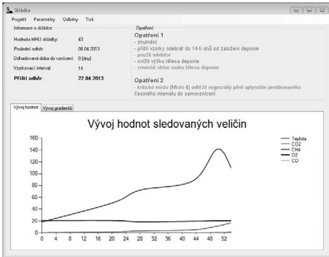
Fig. 2 Graph of time course of values of observed quantities