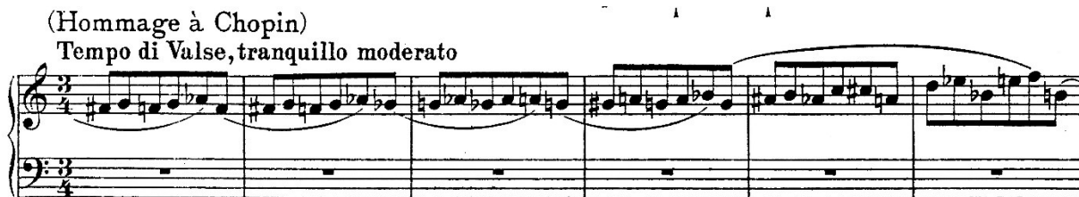
Example 2.10. Busoni Variations on a Prelude by Chopin , BV 213a, Variation IX

The musical challenges probably exceed the technical ones in variation nine. The pianist must immediately impart the sense of a waltz in the six-measure introduction, not awaiting the waltz accompaniment in measure 256. Busoni's directions of tranquil, legato, elegant, and melodious must be respected, but this is difficult considering the sheer volume of notes and the technical difficulties to be overcome. Measures 288 to 295 are a particular challenge because the pianist's tendency is to increase the volume and tension in the ascending passages, but Busoni directs that it must be played piano and become gentler and calmer; this is a difficult musical feat. Finally, it is helpful to think of the rhythm in the last four bars as being in six in order to project the groupings of six in the next and final variation.