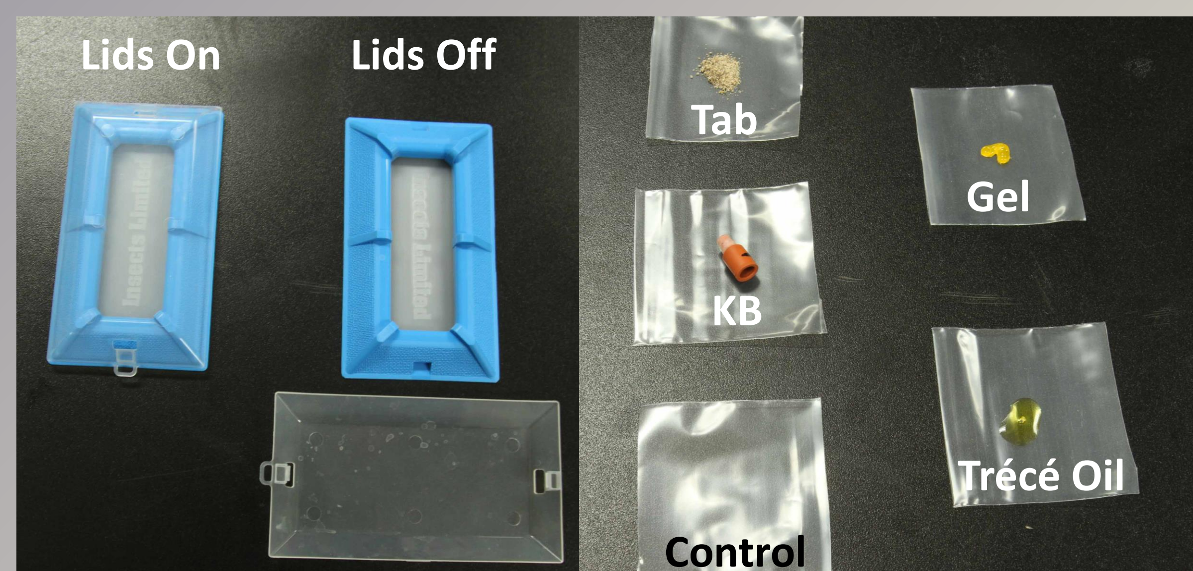
Fig 2. The treatments used in the trapping assay, namely box traps with the lids on (recommended by the manufacturer) or off (left picture), and four different semiochemical lures and an unbaited control (right picture).