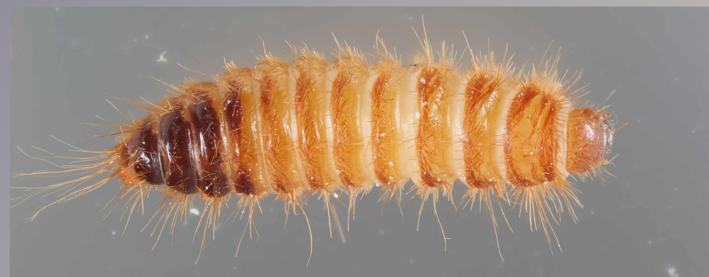
Fig 1. Large warehouse beetle, Trogoderma variabile , larva used in trapping assays.

The objective of this study was to optimize the protocols for a trapping assay to assess the behavior of Trogoderma variabile to various semiochemical stimuli. These data will eventually be compared to corresponding data from KB.