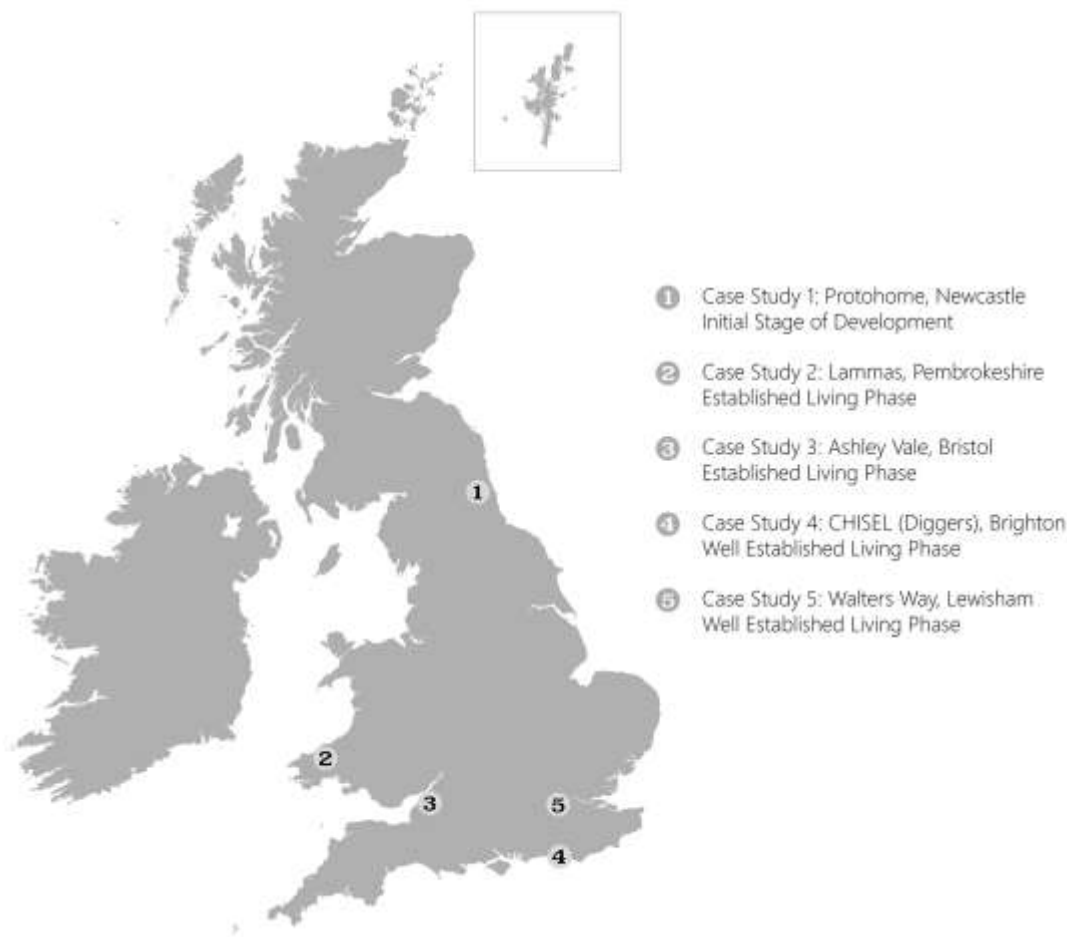
Figure 1: Map showing the distribution of the five case studies (one in Wales and four in England)

Owing to a lack of consistent theory and ambiguous results from existing studies on the effects that community-based projects have on social cohesion, social capital and participation, a Constructivist Grounded Theory (CGT) approach was used to inform theory based on empirical data analysis (Denscombe, 2014; Higginbottom and Lauridsen, 2014). The research process included primary and secondary data collection from self-build case studies, coding of empirical data and comparison between case studies, as well as between the selected case studies and the reviewed literature to elicit and assess how social interactions between people and social phenomena, such as sense of community, are constructed (Bryman, 2012; Creswell, 2014).