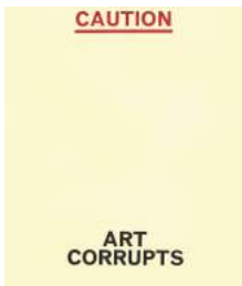
Figure 3. Aberystwyth Fluxconcert 1968 ephemera.