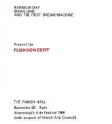
Figure 2. Fluxconcert advertising 1968.