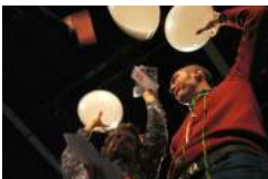
Figure 6. Aberystwyth in Flux (2008).