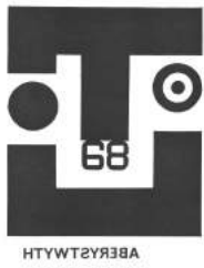
Figure 1. Aberystwyth Arts Festival 1968 programme cover.