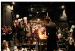
Figure 5. Aberystwyth in Flux (2008).