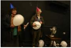
Figure 7. Aberystwyth in Flux (2008).