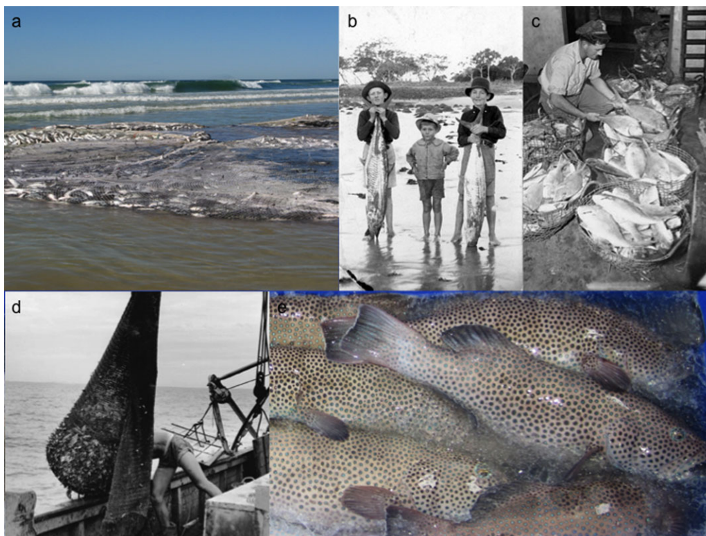
Figure 3 Species targeted by interviewees (a) mullet ( Mugil cephalus ) catch, 2012, (b) mackerel ( Scomberomorus sp.), ca. 1935, (c) snapper ( Pagrus auratus ), 1957, (d) prawn ( Penaeus sp.) trawl haul, 1955, and (e) coral trout ( Plectropomus areolatus ), 2012.

In our study, we used the terms “good,” “typical,” and “poor” when interviewing resource users. These were terms that resource users related to and felt able to answer, but they are also inherently subjective (an issue tackled by Bertrand & Mullainathan 2001 and Ainsworth et al. 2008). This subjectivity, coupled with recall bias, may contribute to the high levels of variance in our data (for example, some fishers’ reported “poor” catches corresponded with their minimum recorded catch, while other reported “poor” catches fell above the 50 th percentile of catch records). This suggests that in order to combat high levels of variability and to successfully detect environmental trends from retrospective observations, large sample sizes are required. As large sample sizes are not always possible, an alternative approach would be to provide more detailed instructions to interviewees prior to the interview, for example, a “good” catch equates to the top 10% of catch, a “poor” catch equates to the bottom 10% of catch. Such an approach could help to reduce variability between fishers and thus increase confidence in the data. Increased confidence in the data could also be achieved by reinterviewing a sample of the original