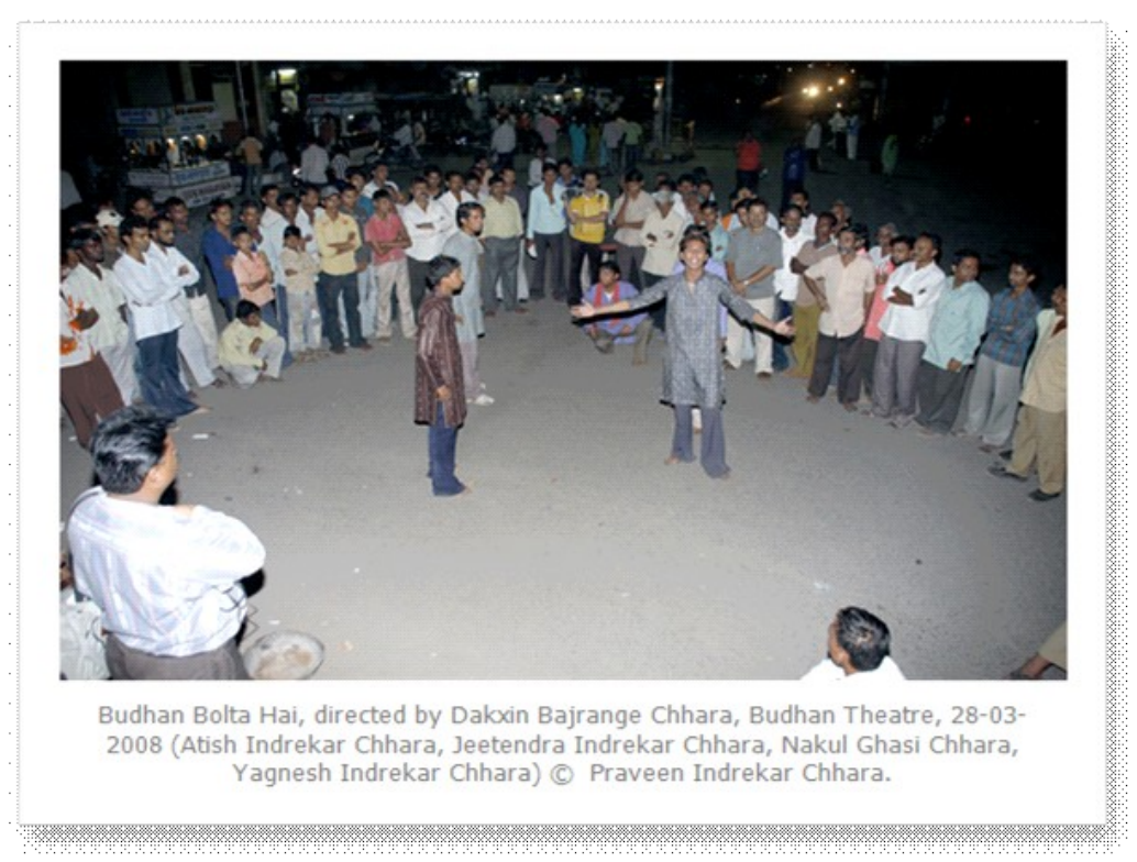
Figure 2: street performance of Budhan Bolta Hai

Budhan's play creation process is democratic. Members come together and decide what issue should be highlighted after conducting community surveys within the Chhara and other DNT or marginalized communities. After deciding on a theme and issues to be addressed, members prepare a plot and decide roles. Then, the play goes to the floor. Actors create dialogues according to their roles and develop the play into a script scene by scene. This draft script then undergoes a series of revisions and editing before the final script is prepared. Actors often improvise during the performance of the plays, changing the dialogues and making them more effective according to the spectators. Budhan's performance and its effects changes according to the space and setting. For instance, the play becomes more tragic and reflects intense police atrocity when they perform it in front of the police station (with the intention of making police feel guilty and/or ashamed of what they do to the DNTs, and most of these police performances are interrupted as the performers are forced to leave or banned from the space). However, the same play emphasizes the innocence (as non-criminal) of the victimized member of the DNT community when they perform it in front of the mainstream spectatorship of India.9