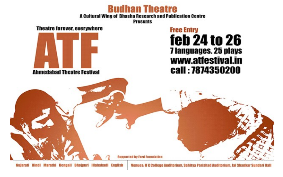
Figure 3: poster of Ahmedabad Arts Festival with sposor details (Ford Foundation)

Budhan's initiative of organising a theatre festival has significant implications within local and broader/national socio-political and theatrical spaces. More than 7,000 people participated in the festival and celebrated the theatre performances in seven different languages of India. The members of Budhan admit an artistic and cultural need for organising theatre festivals in Ahmedabad, as no other group had organised such a grand festival with such a number of shows with cultural and linguistic diversity. Roxy says, "It was us, Budhan theatre, who initiated the tradition of organising a theatre festival which is now followed by some local organisers; however, these are highly commercial performances and festivals" (R. Gagdekar, personal interview, July 17, 2015).