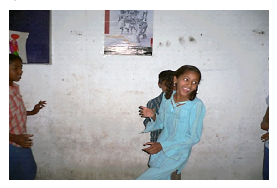
Figure 1: a photograph at Budhan Theatre library - children being trained for theatre making

The Chharanagar library is established in only one room in which they have hundreds of books on radical literature, art, history, and language. These books are donated by a number of people and institutions. They have the daily Gujarati newspaper and computers in their library. The school/college students and children from Chharanagar gather at the library on a daily basis for their study and theatre training. The Chhara youth learn from each other and are committed towards sensitizing the community to the idea that 'Chharas are not born criminals, they are born performers'.<sup>8</sup>