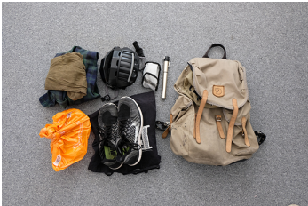
Figure 2: Workshop participants showed what objects they carry for their everyday commute.