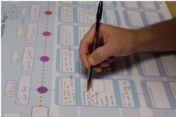
Figure 3: Journey map template participants completed with facilitators after enactment workshop role playing sessions.

process with researchers and designers, recalling and reflecting on their journey details.