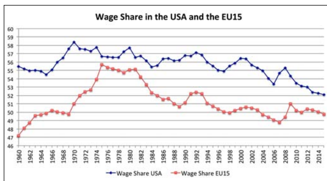
Figure 2: The share of wages in the GDP in the USA and the EU over time

An alternative explanation takes political economy seriously. For this purpose, the approach of critical political theorist Franz L. Neumann in his 1957 essay Anxiety and Politics is helpful. The rise of right-wing authoritarianism according to this explanation has to do with the alienation of labor (see Figures 2 and 3); destructive competition; social alienation that creates fear of social decline; political alienation from the political system, politicians, and political parties; and the institutionalization of anxiety by far-right groups that stoke fears and advance the politics of scapegoating.