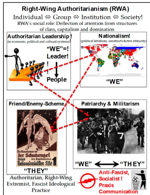
Figure 1: A Model of right-wing authoritarianism

enemy scheme; and militant patriarchy (law and order policies; idealization of warfare and soldiers; repression of constructed enemies; conservative gender relations). RWA serves the ideological purpose of distracting attention from the role of class structures and capitalism as foundations and causes of social problems. Refugees, immigrants, developing nations, Muslims, etc., are constructed as scapegoats who are blamed for problems such as unemployment, low wages, economic stagnation, the decline of public services, the housing crisis, and crime. Trump blames Mexico and China for deindustrialization and social decline without ever mentioning that US capital exploits workers both in the US and in destinations of outsourced capital, including in Chinese sweatshops and Mexican maquiladoras .