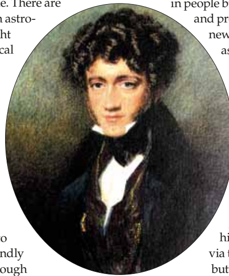
1 John Herschel, painted in 1829 by Alfred Edward Chalon, one of several images of him in the MacTutor database. This article uses Herschel's biography as an example of the scope of the entries.

The 2800-word biography of Herschel that follows mentions and links to the biographies of 20 other mathematicians and scientists. We read about his father, William Herschel, discoverer of Uranus, and his aunt Caroline, William's sister. She played a