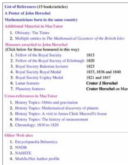
3 (Right) MacTutor's supplementary material on John Herschel.

large part in John's upbringing and has an entry in MacTutor as an astronomer in her own right: she was one of the first women to be paid for scientific work (£50 per year from George III, beginning in 1787), and received the RAS Gold Medal in 1828 for her catalogue of 2500 nebulae.