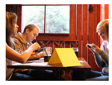
Figure 3: MobiComics allows collocated groups to curate and share comic strip panels.