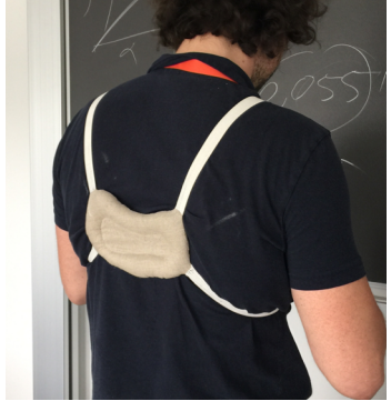
Figure 6. MobileHCI '15 workshop (afternoon, 'hands on', session): In teams, attendees used different materials consisting of fabrics, conductive fabrics, and assortments of various artefacts, to provoke thought and explore ideas around embodied and tangible interactions.

Martin Porcheron is a PhD student in the Mixed Reality Laboratory at the University of Nottingham. His work has focused on the use of mobile devices within collocated groups. His research includes examining the social implications of mobile device use and the positioning of mobile devices as resources that people can draw upon in conversations.