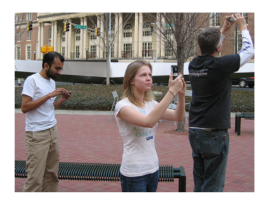
Figure 2: Mobiphos allows group of people to simultaneously capture and share photos.