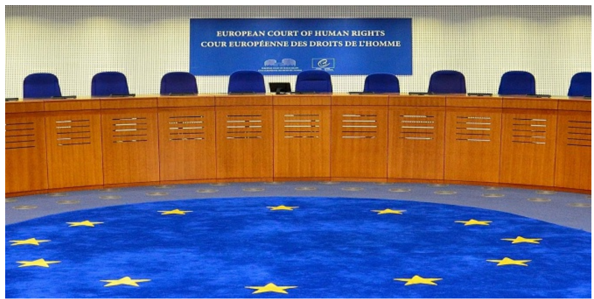
Courtroom of the European Court of Human Rights

Pointing to a qualitative change that has taken place in Russia's relationship with the ECtHR, this development and its implications are discussed at length in the volume. As Mälksoo notes, the danger is now that of a 'European human rights protection system "with two speeds" (25) in which Russia – possibly soon followed by others – can now choose to implement rulings à la carte . More generally, the current situation ultimately leaves both parties unsatisfied and can therefore hardly be considered sustainable in the long term. The prospect of Russia leaving the CoE altogether has already been mooted, although this is also due to fallout from the 2014 Ukraine crisis. Accordingly, many of the authors break the twenty-year-old relationship down into different phases, with the current one characterised by a sense of confrontation.