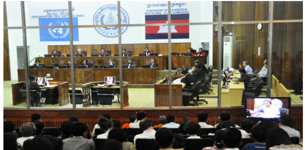
49th day of the Duch-trial before the Extraordinary Chambers in the Courts of Cambodia, 22 July 2009

asserts a progressive aspiration which is based on an imagined transformation from authoritarianism to democracy in societies after conflict. The transitional justice imaginary, in contrast with a 'phenomenological transitional justice', glosses over the lived experiences embedded in historical, social and political contexts by assuming an invariable imaginary with liberal democratic ends. According to Hinton, the transitional justice imaginary provides a distanced and surface-level view which masks power and the complexities of everyday experience: that is, it offers only a justice facade (25).