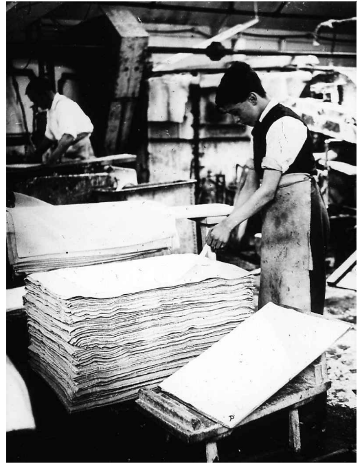
Figure 2 Papermaking in the Edinburgh area.

(from the Heritage Lottery Fund, the Pilgrim Trust, Gordon Fraser Charitable Trust, the Russell Trust, and John Lewis plc) to support its new project 'Bringing the Page to Life: Papermaking on the Water of Leith'. 'Bringing the Page to Life' will be the first sustained and focused attempt to record the oral and social history of the Scottish papermaking industry, which was a major employer in a number of districts in Scotland. It will focus on the Water of Leith, which with a number of mills was an important centre for papermaking in the Edinburgh area. A feasibility study has already brought forward 21 prospective interviewees who worked in various mills on the Water of Leith. It is hoped that these interviews with the men and women who worked in this industry will provide valuable insights into the relationship between the papermaking industry and the communities on which they were based. The research will culminate in an exhibition on the history of the papermaking industry at the Water of Leith Visitor Centre in early 2004, and the publication of a book on the history of papermaking to coincide with this exhibition.