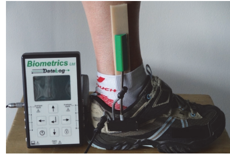
FIGURE 1: Data logger and position of the electrogoniometer end blocks on the lateral surface of the lower leg and shoe.

2.1. Participants. Participants with a clinical diagnosis of definite MS according to the McDonald criteria [25] were included in the study if they presented with unilateral foot