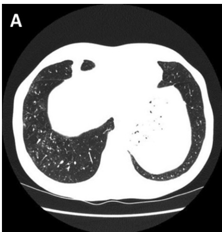
Fig. 1A – CT-scan; basal section showing bronchiolitis and a diffuse mild micronodular pattern.

Six months after initial presentation, the symptoms – fever and fatigue – continued. A renewed interview revealed that 4 months before initial presentation, the patient had an indoor hot tub installed. A water sample of the hot tub was collected for culture. Ziehl-Neelsen stain of a sediment was reported [2] and corresponding cultures grew M. avium . The