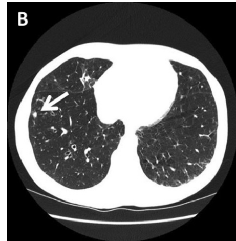
Fig. 1B – CT-scan; the arrow shows a nodular lesion in the right lower lobe, with mild bronchiectasis; “tree-in-bud” aspect of bronchiolitis in the left lower lobe.