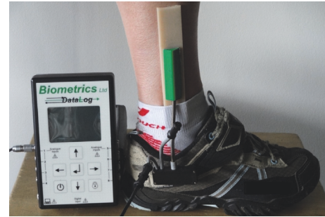
FIGURE 1: Data logger and position of the electrogoniometer end blocks on the lateral surface of the lower leg and shoe.

2.1. Participants. Participants with a clinical diagnosis of definite MS according to the McDonald criteria [25] were included in the study if they presented with unilateral foot