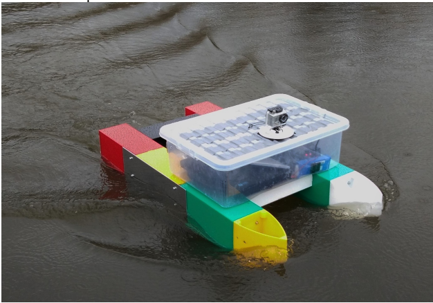
Fig. 2. A catamaran configuration in operation performing autonomous navigation and side-scan sonar mapping of the Kennet and Avon Canal in Bath, UK.

metres either side of the platform. This allows large swaths of terrain to be mapped rapidly, picking up features of potential interest. A multi-beam echo-sounder is also used, which is able to produce a high-resolution three dimensional map directly beneath the platform. This imaging system may be used to interrogate features detected by the side-scan sonar at much higher resolution. By fusing the data collected by these systems and the platform's GPS location, it is possible to localise these features and display them for human or autonomous classification.